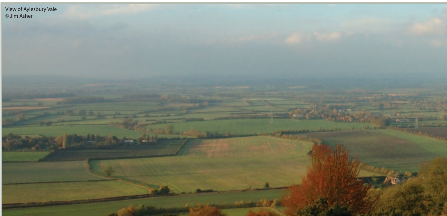
View of Aylesbury Vale